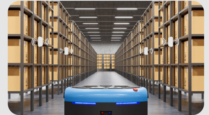
Warehouse Asset Tracking

MRepeater integration, MWC01 Badge Repeater and MBT02 Asset Repeater. MWC01 performs accurate personnel management, with high accuracy and emergency response abilities. Besides, MBT02 performs asset tracking with efficiency. Improve workplace efficiency and security with these 2 smart gadgets, which provide precise people management, and efficient asset monitoring, and both of them are cutting-edge hardware solutions in IoT industry.