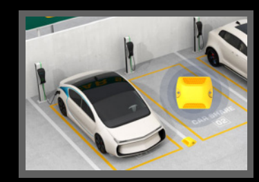
Vehicle Management •Parking & Checking in •Vehicle information collection •Vehicle positioning and tracking •Shared vehicle management